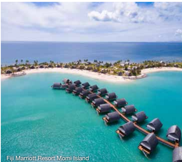
Fiji Marriott Resort Momi Island

Find deals from Qantas Holidays for Fiji and Vanuatu at travelmanagers.com.au or ask your personal travel manager.