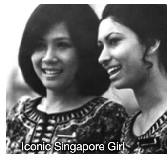
Iconic Singapore Girl