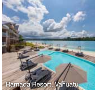
Ramada Resort, Vanuatu