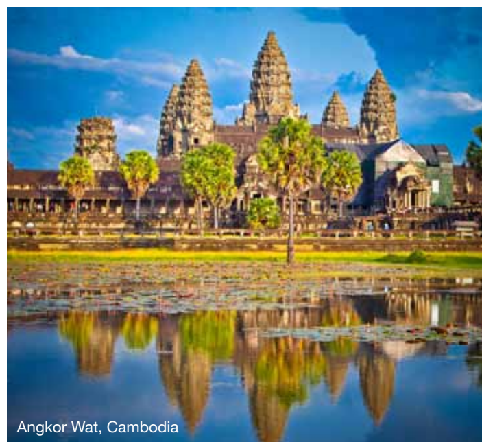
Angkor Wat, Cambodia