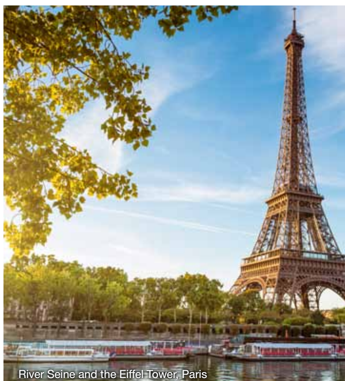
River Seine and the Eiffel Tower, Paris

Find Rail Plus deals at travelmanagers.com.au or ask your personal travel manager.