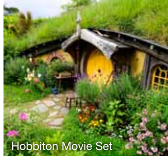
Hobbiton Movie Set