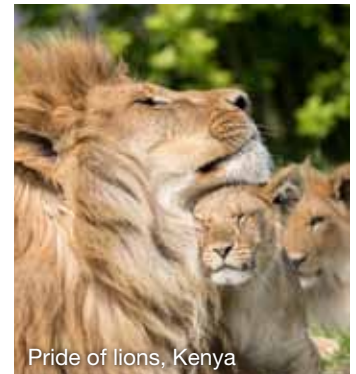
Pride of lions, Kenya

Since first opening in New Zealand in 1986 and its arrival in Australia in 2007, House of Travel has grown into the largest independent travel company in Australasia. This means that not only does your personal travel manager have access to amazing travel deals, but you are provided with peace of mind as your money is secure through the booking process.