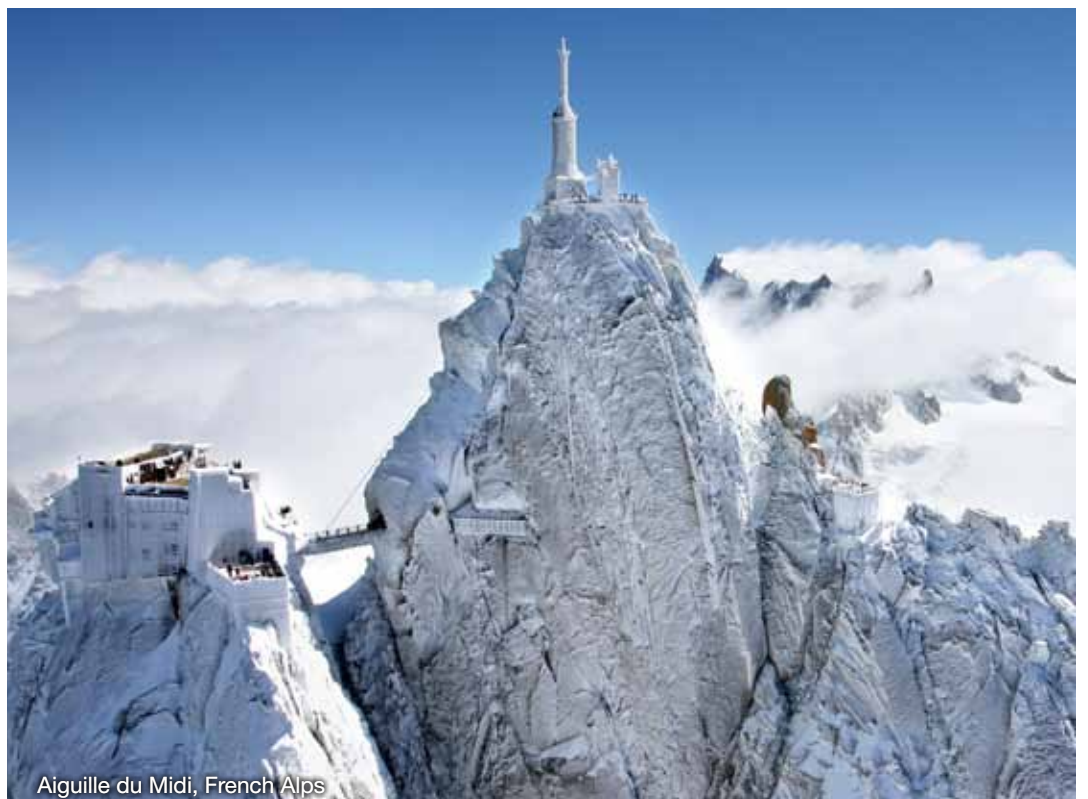
Aiguille du Midi, French Alps

Find festive season deals from Albatross Tours at travelmanagers.com.au or ask your personal travel manager.