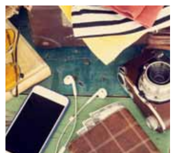
Vomo Island Resort, Fiji

Stay connected without it costing a fortune.