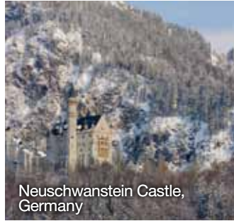
Neuschwanstein Castle, Germany