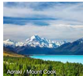
Aoraki / Mount Cook