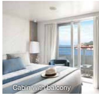
Cabin with balcony