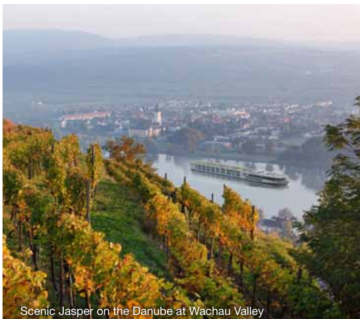
Scenic Jasper on the Danube at Wachau Valley

The Scenic Space-Ship fleet cruises the rivers of Europe in all-inclusive luxury. From exclusive Scenic Enrich experiences and Freechoice activities, butler service, sumptuous meals at a choice of up to six onboard dining venues, complimentary beverages, transfers and tips: everything is included.