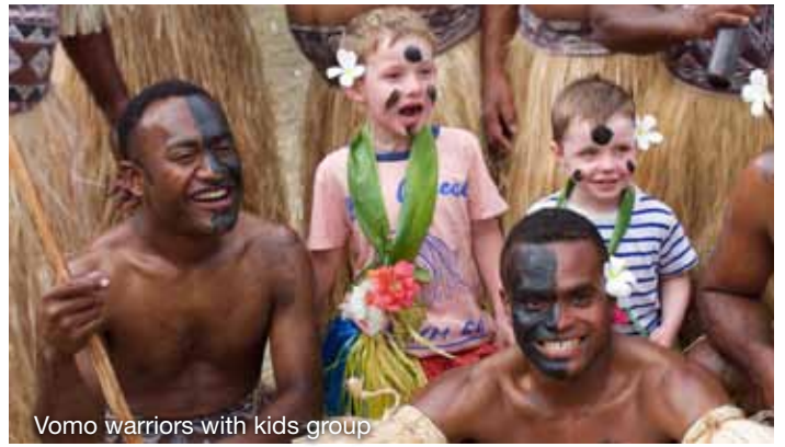
Vomo warriors with kids group