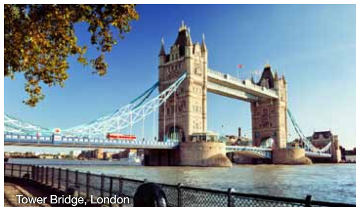
Tower Bridge, London