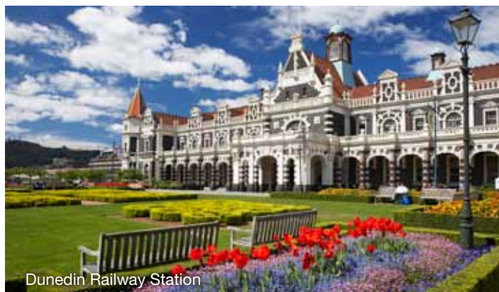
Dunedin Railway Station