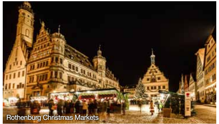
Rothenburg Christmas Markets