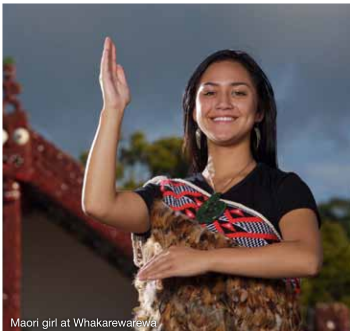
Maori girl at Whakarewarewa

Travel with Grand Pacific Tours, the New Zealand coach holiday specialist, and experience spectacular landscapes plus a rich Maori culture.