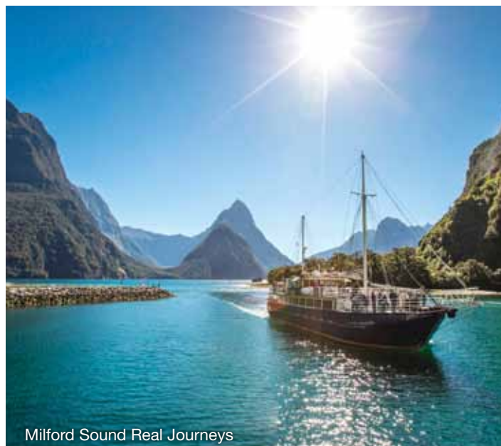
Milford Sound Real Journeys

From here you'll drive through the heart of the South Island, crossing the vast Canterbury Plains. Ascending Burkes Pass, you'll come to the picturesque lakeside town of Tekapo. Follow the road and take in the view of Aoraki Mt Cook (New Zealand's tallest mountain) from the shores of Lake Pukaki, known for its glacier-fed, turquoise colour.