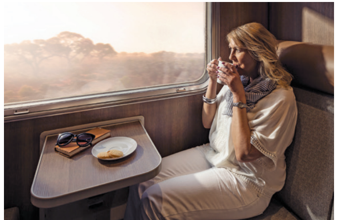
GOLD SERVICE SINGLE CABIN BY DAY

And to cap this off, one of the fondest memories of your journey will be the enjoyment of sharing this extraordinary adventure with like-minded travellers.