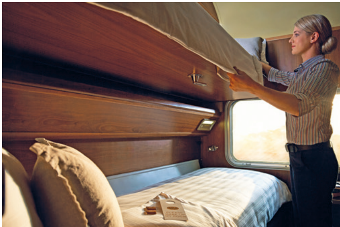
GOLD SERVICE TWIN CABIN BY NIGHT

FROM THE MOMENT YOU STEP ABOARD YOU CAN FEEL IT - A SPIRIT OF ADVENTURE AND A SENSE OF SOMETHING VERY SPECIAL ABOUT TO UNFOLD.